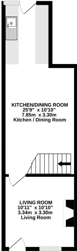
GROUND FLOOR 356 sq.ft. (33.0 sq.m.) approx.